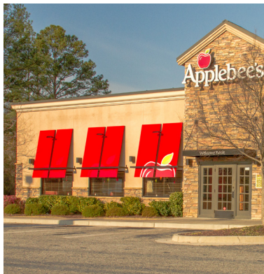
NET LEASE RETAIL